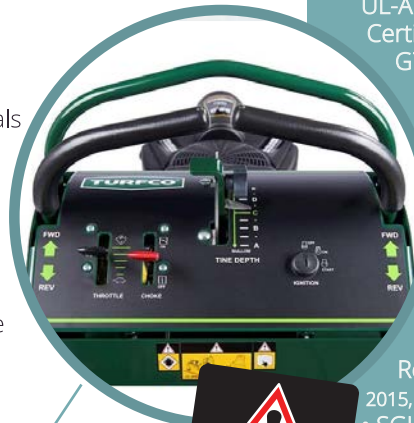
SCREEN PRINT OVERLAY & VINYL WARNING DECALS