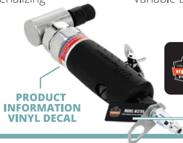
PRODUCT INFORMATION VINYL DECAL